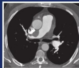
Imagem em Circulação Pulmonar